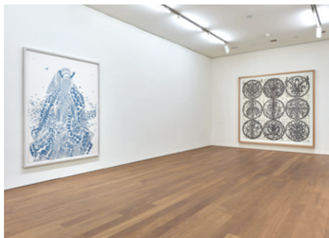
Exhibition view I'm a Lost Giant in a Burnt Forest , Rui Moreira 2014, MUDAM, Luxembourg